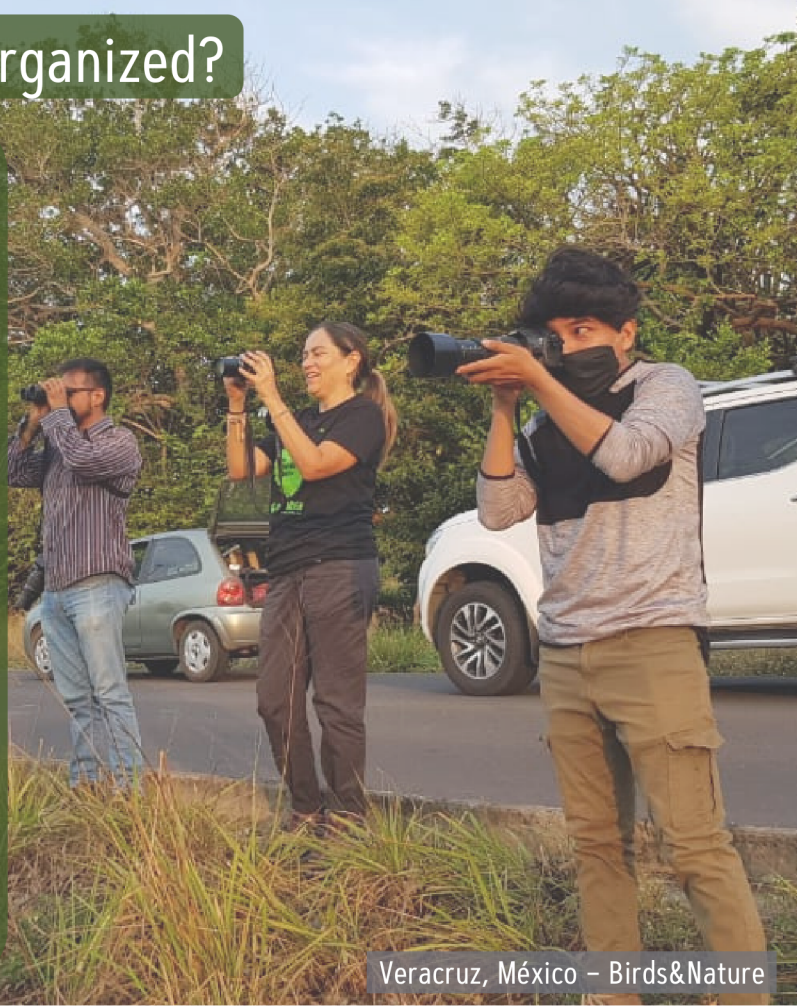
Veracruz, México – Birds&Nature

While the City Nature Challenge is coordinated by the Community Science teams at the Natural History Museum of Los Angeles County (NHM) and the California Academy of Sciences (CAS), the success of the CNC is really due to the local organizers. Every official CNC city or metro area has a person or multiple people from that region who have taken on the role as local organizer, often times as part of their job in an organization that is mission-aligned with the goals for the CNC, but many organizers also volunteer their time. NHMLAC and CAS start meeting regularly with organizers six months prior to the CNC, and provide support, training, and tools, and the local organizers then promote and implement the CNC in the ways that work best in their communities. Many organizers have formed local partnerships with organizations such as city/regional governments, parks departments, science/nature centers, scouts, schools and universities, and nature groups to help spread the word, organize local events, and build community for the City Nature Challenge.